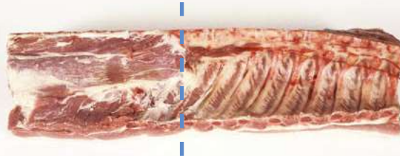
2 The fillet section (Lumbar) of the loin needs to be removed. The rib section (Thoracic) is cut into 20 mm thick chops.