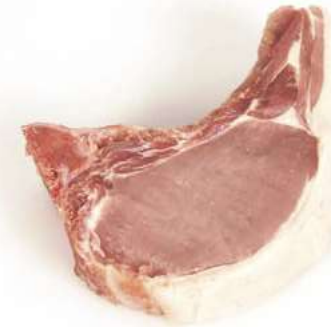
3 Chops – rib section of the loin.